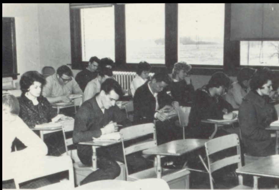
STUDYING HARD is the English Literature class as they read their assignment.