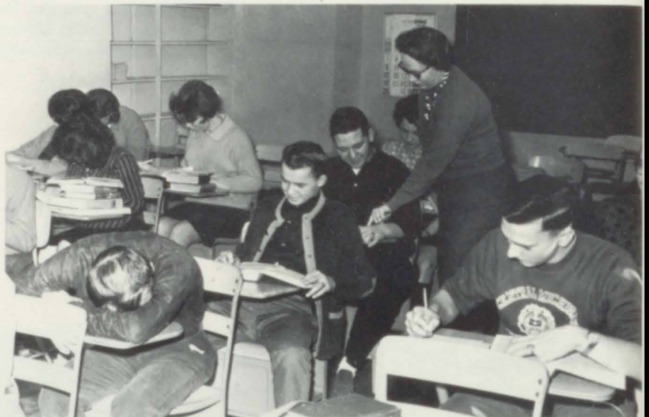
SPEECH STUDENTS study to better themselves in oral communication.